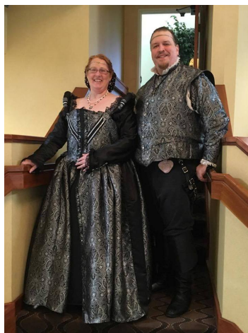
Elizabethan Dress and Men's Short Doublet with detachable sleeves.