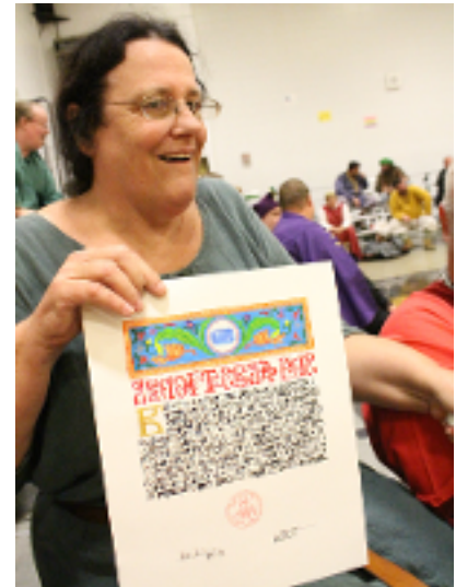
Mistress Ilyana awarded the Sapphire at Martial Rum