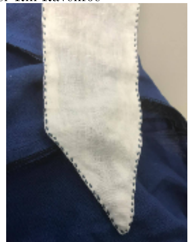
Hand Sewn Tippets