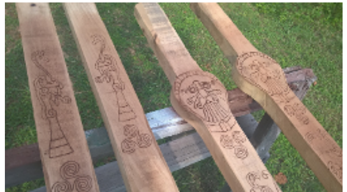
New Ring Tribe Encampment pavilion poles. La Tene and Insular art. Celtic face is Msecke Zehrovice man head. Curvaliner bar is Lisnacrogher scabbard inspired.