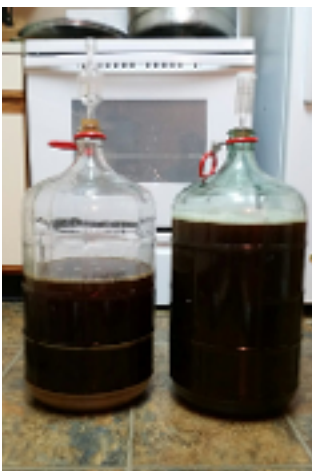
Peach Lambic and 15th Century Ale in the fermentor.

Master Rin Ravenfoe Photo: Master Rin Ravenfoe