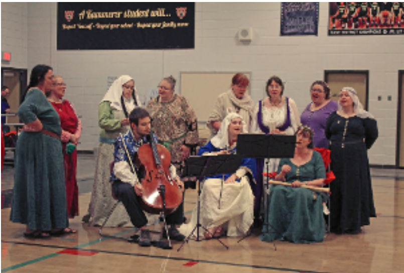
Flamma Chorom performs before court at Martial RUM