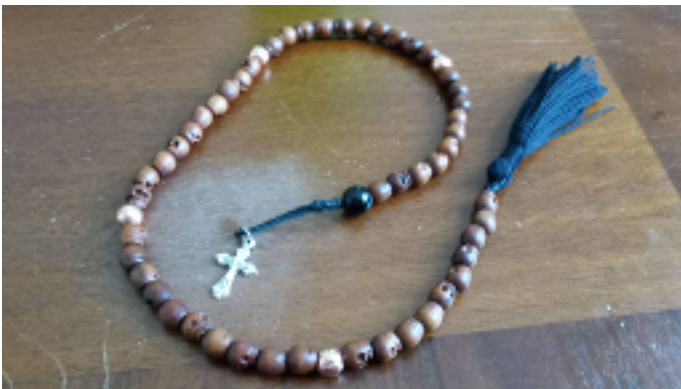
14th Century Paternoster made with small carved wood skulls and copper beads.